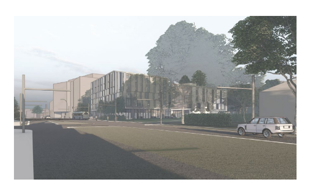
Approaching from University Boulevard

Phone: (604) 660-1808 Fax: (604) 660-1874