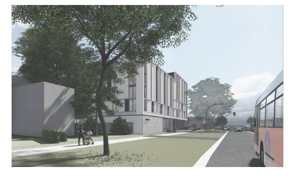
Approaching from Wesbrook Mall